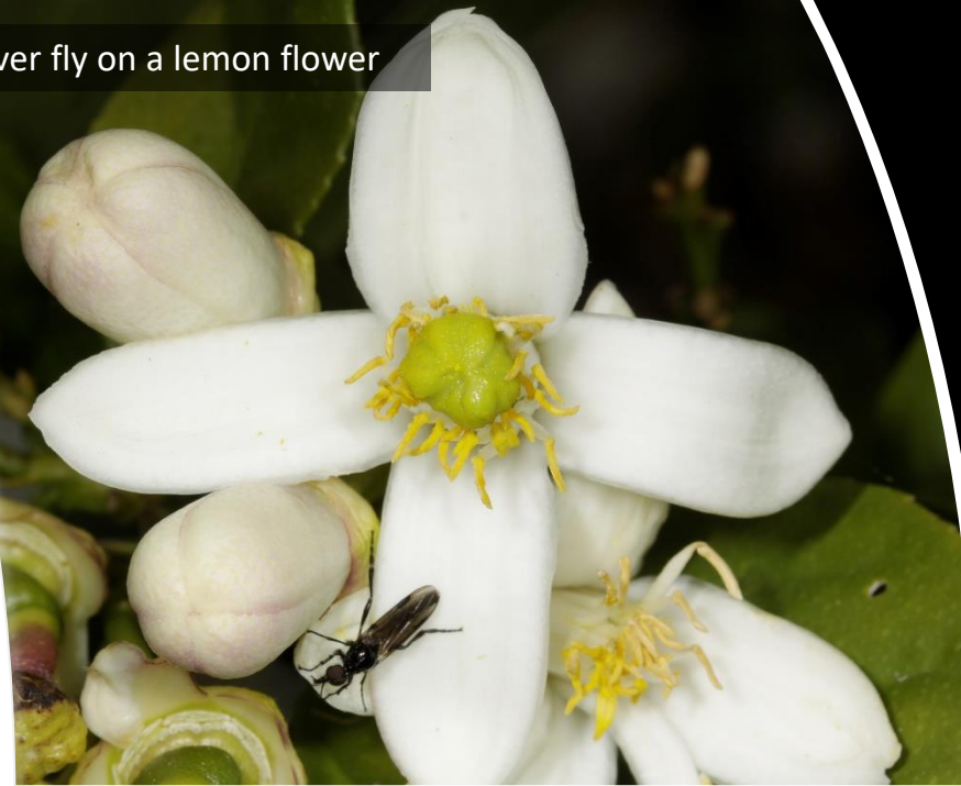
Hover fly on a lemon flower