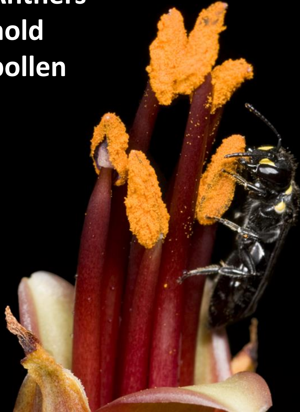
Native masked bee collecting pollen in NZ Flax flower