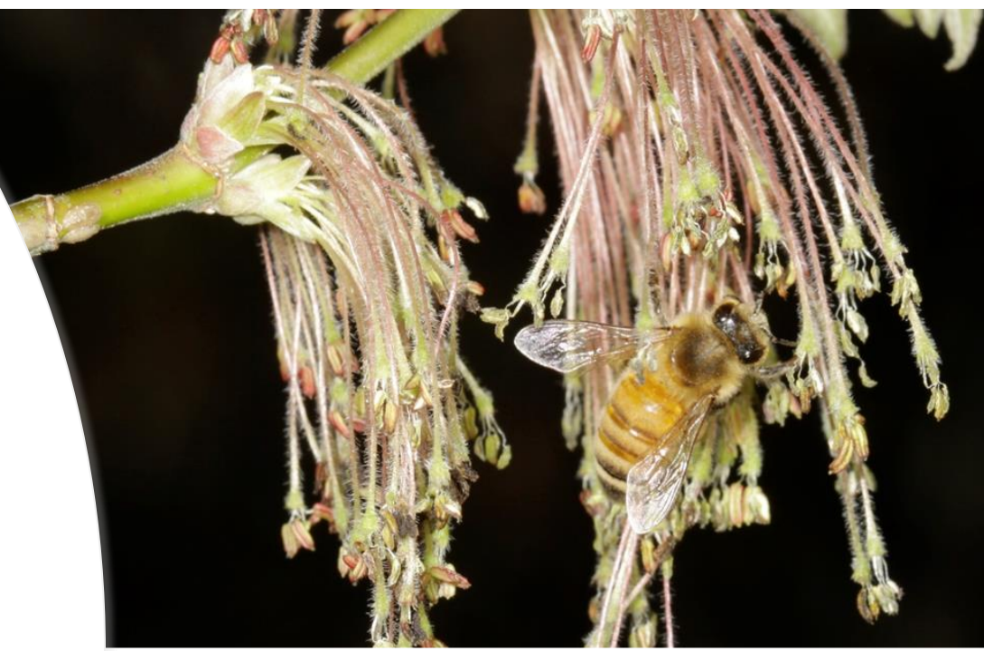
Box elder maple

Wind-pollinated trees produce copious pollen