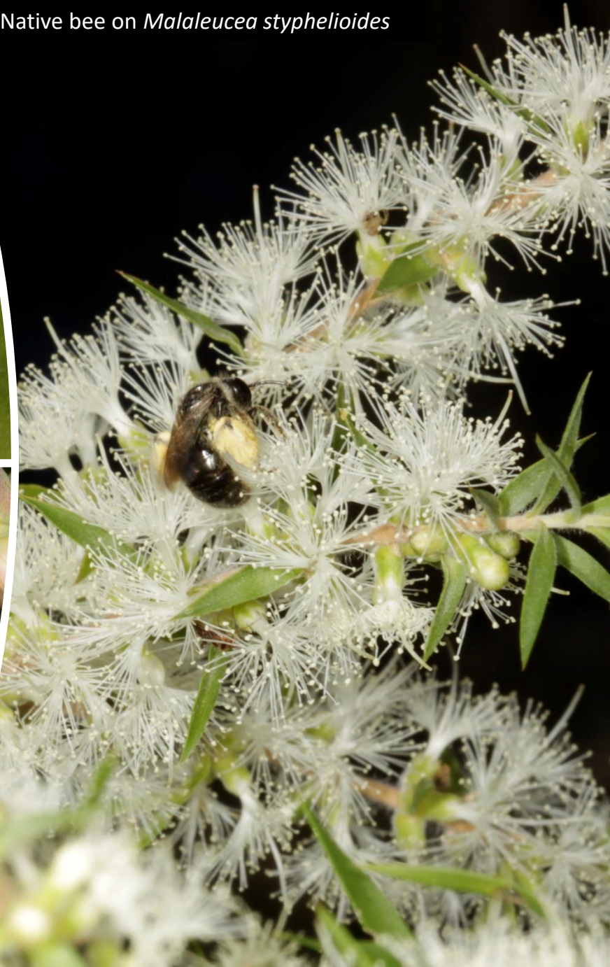
Native bee on Malaleuca styphelioides